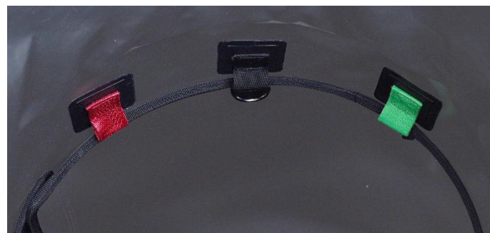
5 attachment points inside